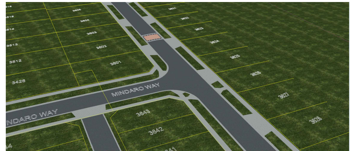
DIGITAL RENDER - LOCATION 4 LOT 3642 LOOKING NORTH EAST

WARNING Beware of Underground Services The locations of underground services are approximate only and their exact position should be proven on site. No guarantee is given that all existing services are shown. Locate all underground services before commencement of works BEFORE YOU DIG www.byda.com.au