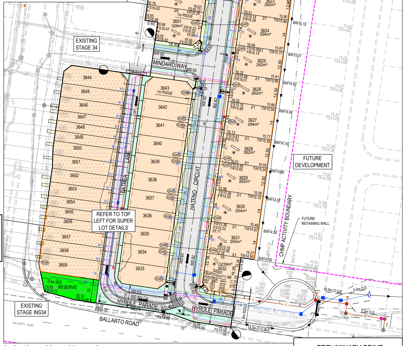
0 5 10 20 30 40 Scale 1:1000 @ A3 0 5 10 20 30 40 Scale 1:500 @ A1

WARNING BWARE OF UNDERGROUND SERVICES The locations of underground services are approximate only and their exact position should be proven on site. No guarantee is given that all existing services are shown. Locate all underground services before commencement of works BEFORE YOU DIG www.bywida.com.au