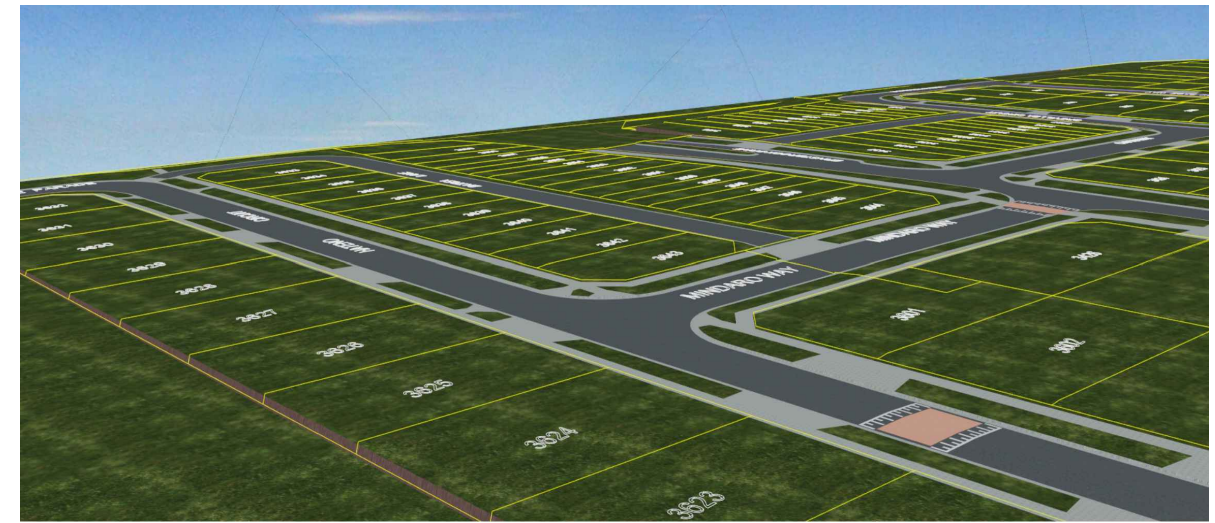
DIGITAL RENDER - LOCATION 2 LOT 3623 LOOKING SOUTH WEST