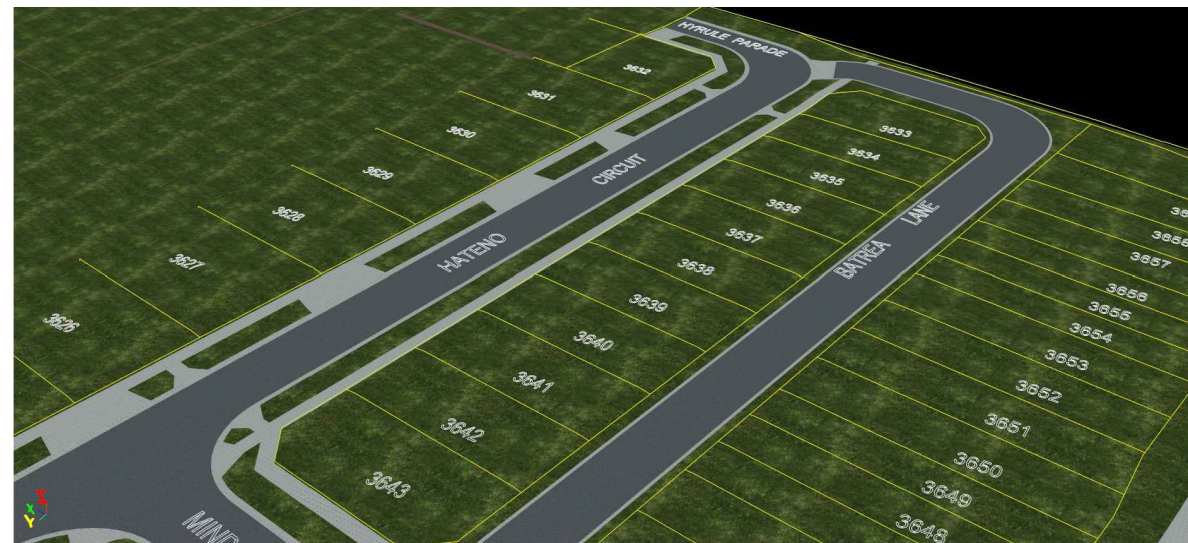
DIGITAL RENDER - LOCATION 3 LOT 3643 LOOKING SOUTH EAST