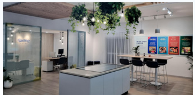
RIVERFIELD SALES OFFICE Open 7 days, 11am – 5pm Call our friendly sales team or email riverfield@bpg.com.au