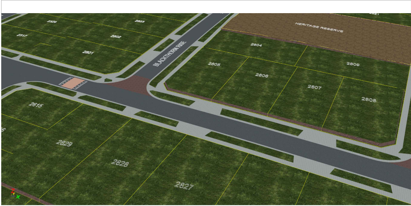
DIGITAL RENDER - LOCATION 3 CORNER OF BLACKTHORN RISE AND NOIR STREET LOOKING NORTH WEST