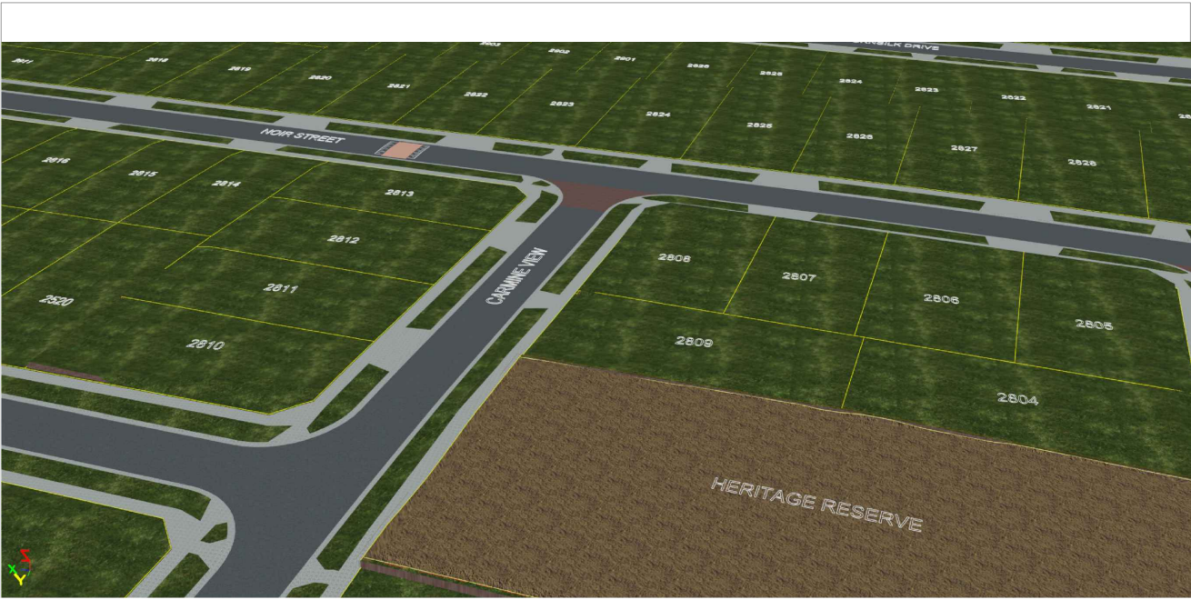
DIGITAL RENDER - LOCATION 2 CORNER OF CARMINE VIEW AND NOIR STREET LOOKING SOUTH EAST